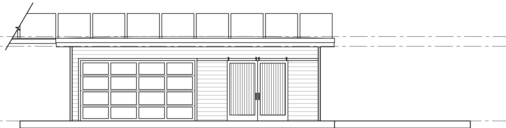
NORTH ELEVATION 1/4" = 1'-0"