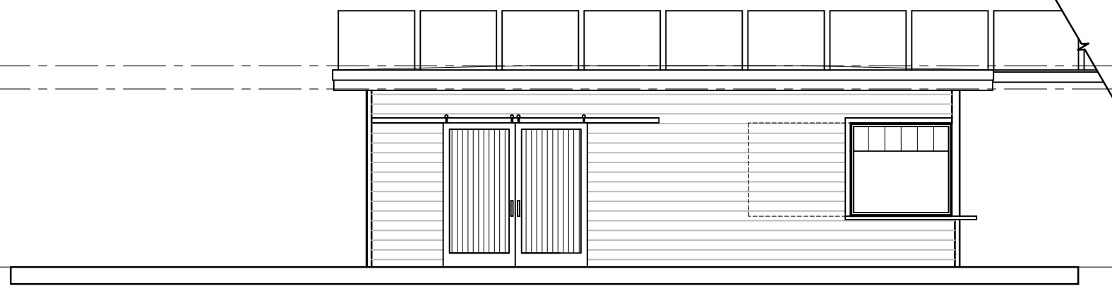
SOUTH ELEVATION 1/4" = 1'-0"