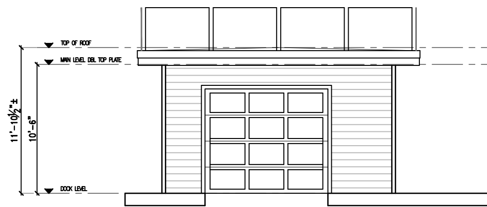
WEST ELEVATION 1/4" = 1'-0"