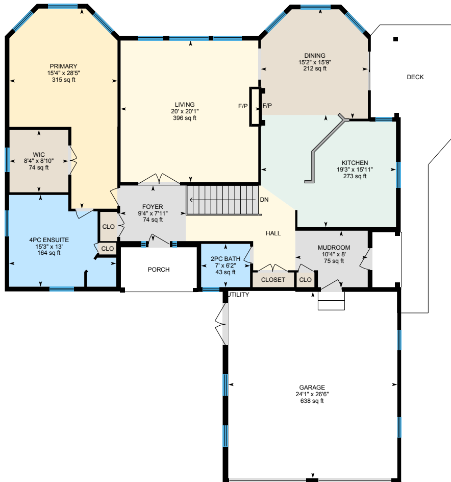
Main Floor Exterior Area 2001.84 sq ft

Main Building: Total Exterior Area Above Grade 2001.84 sq ft